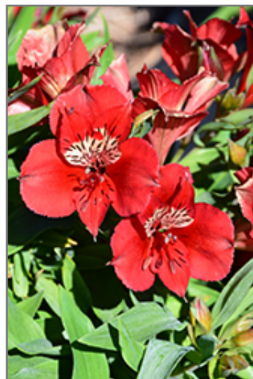
Colorita Kate Alstroemeria flowers

Colorita Kate Alstroemeria is recommended for the following landscape applications;