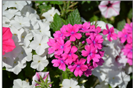
Superbena Pink Shades Verbena flowers

Superbena Pink Shades Verbena is recommended for the following landscape applications;