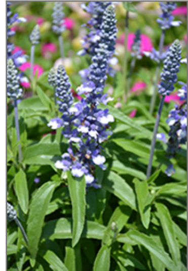
Cathedral Shining Sea Salvia flowers

This plant will require occasional maintenance and upkeep, and should be cut back in late fall in preparation for winter. It is a good choice for attracting butterflies and hummingbirds to your yard, but is not particularly attractive to deer who tend to leave it alone in favor of tastier treats. It has no significant negative characteristics.