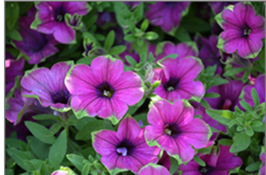
Supertunia Picasso In Purple Petunia flowers

Supertunia Picasso In Purple Petunia is a dense herbaceous annual with a trailing habit of growth, eventually spilling over the edges of hanging baskets and containers. Its medium texture blends into the garden, but can always be balanced by a couple of finer or coarser plants for an effective composition.