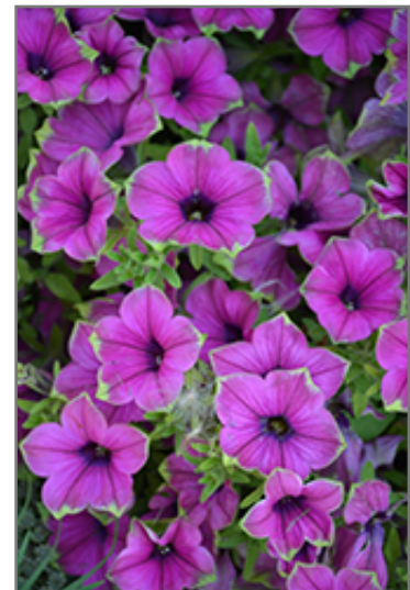
Supertunia Picasso In Purple Petunia flowers