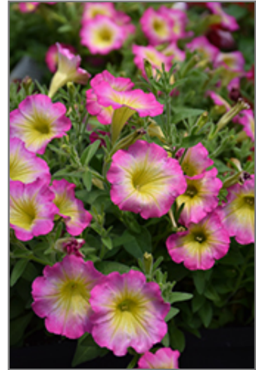
Supertunia Daybreak Charm Petunia flowers

Supertunia Daybreak Charm Petunia is a dense herbaceous annual with a trailing habit of growth, eventually spilling over the edges of hanging baskets and containers. Its medium texture blends into the garden, but can always be balanced by a couple of finer or coarser plants for an effective composition.