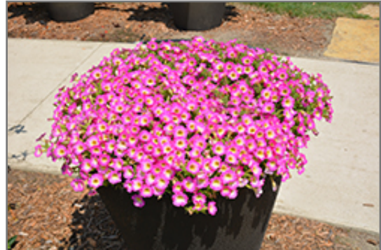
Supertunia Daybreak Charm Petunia in bloom