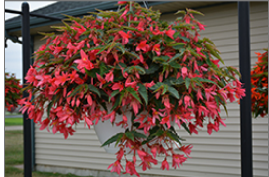
Bossa Nova Pink Glow Begonia in bloom

Bossa Nova Pink Glow Begonia is a fine choice for the garden, but it is also a good selection for planting in outdoor containers and hanging baskets. Because of its trailing habit of growth, it is ideally suited for use as a 'spiller' in the 'spiller-thriller-filler' container combination; plant it near the edges where it can spill gracefully over the pot. Note that when growing plants in outdoor containers and baskets, they may require more frequent waterings than they would in the yard or garden.