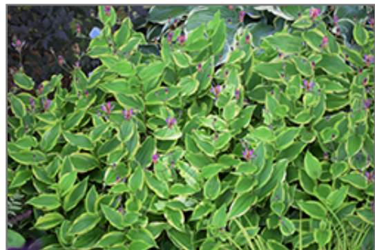
Autumn Glow Toad Lily in bloom