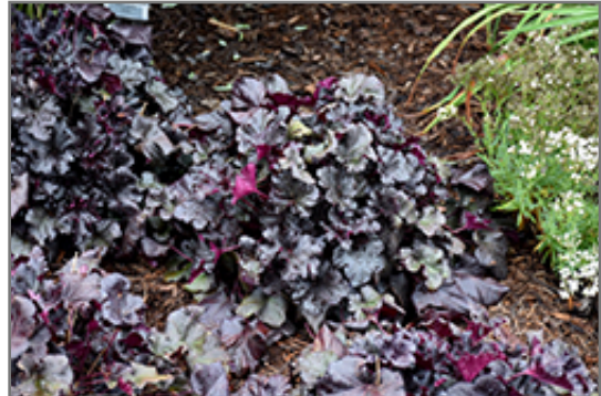
Black Pearl Coral Bells

Black Pearl Coral Bells will grow to be about 10 inches tall at maturity extending to 20 inches tall with the flowers, with a spread of 26 inches. When grown in masses or used as a bedding plant, individual plants should be spaced approximately 20 inches apart. Its foliage tends to remain low and dense right to the ground. It grows at a medium rate, and under ideal conditions can be expected to live for approximately 10 years. As an evergreen perennial, this plant will typically keep its form and foliage year-round.