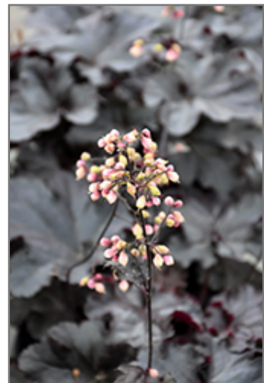
Black Pearl Coral Bells flowers