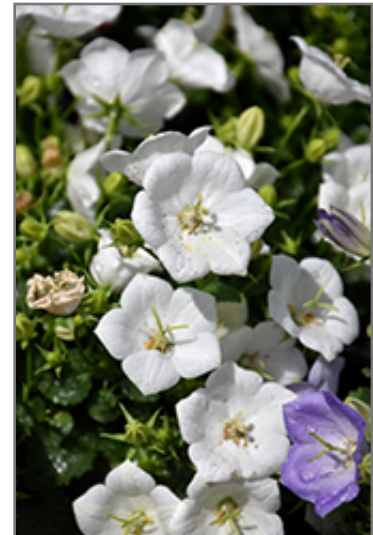
Rapido White Bellflower flowers

Rapido White Bellflower is recommended for the following landscape applications;