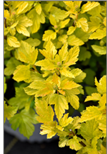
Tiny Wine Gold Ninebark foliage

Tiny Wine Gold Ninebark is recommended for the following landscape applications;