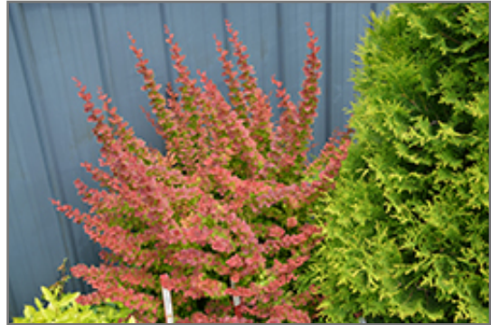
Sunjoy Tangelo Japanese Barberry

Sunjoy Tangelo Japanese Barberry will grow to be about 4 feet tall at maturity, with a spread of 4 feet. It tends to fill out right to the ground and therefore doesn't necessarily require facer plants in front. It grows at a medium rate, and under ideal conditions can be expected to live for approximately 20 years.