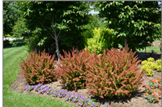
Sunjoy Tangelo Japanese Barberry