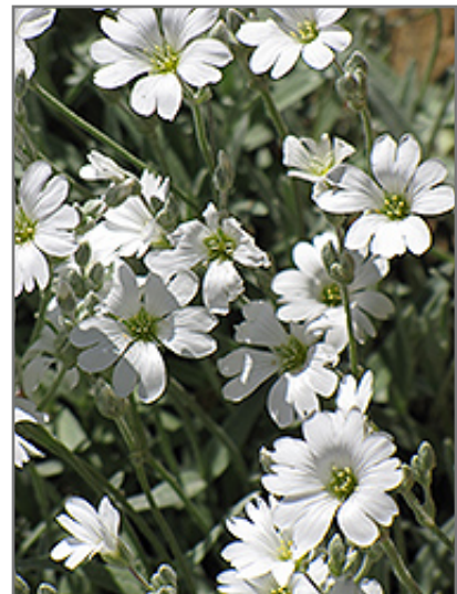
Snow-In-Summer flowers