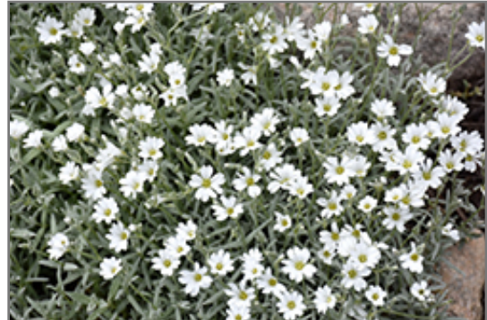
Snow-In-Summer flowers