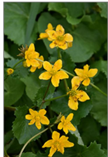
Marsh Marigold flowers