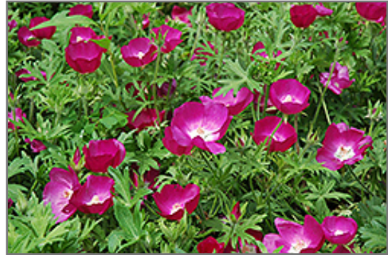
Buffalo Poppy flowers

Buffalo Poppy is recommended for the following landscape applications;