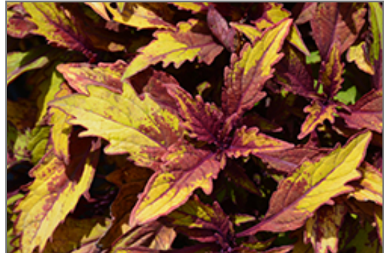
FlameThrower Spiced Curry Coleus foliage

FlameThrower Spiced Curry Coleus is recommended for the following landscape applications;