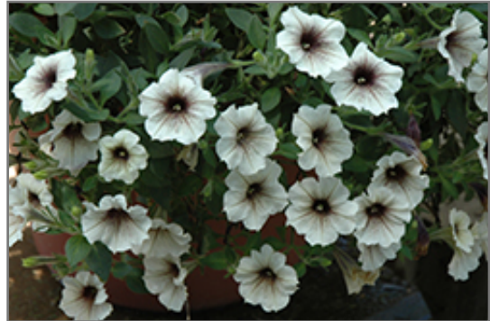
Supertunia Latte Petunia flowers

Supertunia Latte Petunia is recommended for the following landscape applications;