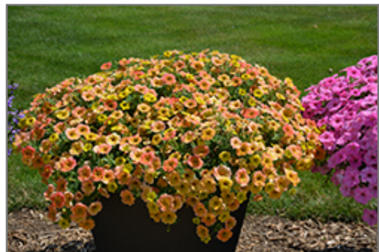
Supertunia Honey Petunia in bloom