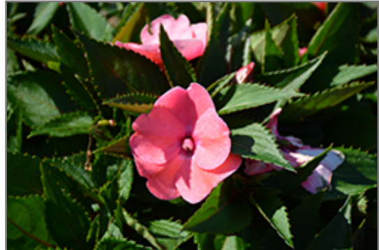
SunPatiens Spreading Shell Pink New Guinea Impatiens flowers

SunPatiens Spreading Shell Pink New Guinea Impatiens is recommended for the following landscape applications;