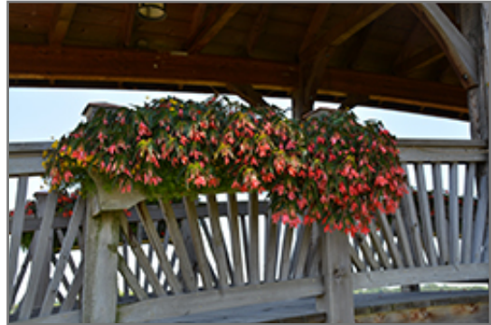
San Francisco Begonia in bloom

San Francisco Begonia will grow to be about 12 inches tall at maturity, with a spread of 24 inches. When grown in masses or used as a bedding plant, individual plants should be spaced approximately 20 inches apart. Its foliage tends to remain dense right to the ground, not requiring facer plants in front. Although it's not a true annual, this plant can be expected to behave as an annual in our climate if left outdoors over the winter, usually needing replacement the following year. As such, gardeners should take into consideration that it will perform differently than it would in its native habitat.