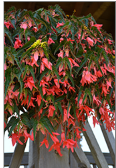
San Francisco Begonia in bloom