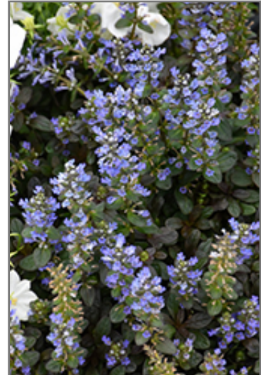
Chocolate Chip Bugleweed flowers

Chocolate Chip Bugleweed is recommended for the following landscape applications;