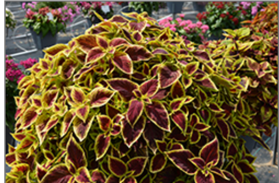
Premium Sun Crimson Gold Coleus

Premium Sun Crimson Gold Coleus will grow to be about 18 inches tall at maturity, with a spread of 18 inches. When grown in masses or used as a bedding plant, individual plants should be spaced approximately 15 inches apart. Although it's not a true annual, this fast-growing plant can be expected to behave as an annual in our climate if left outdoors over the winter, usually needing replacement the following year. As such, gardeners should take into consideration that it will perform differently than it would in its native habitat.