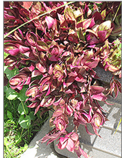
Purple Wandering Jew

Purple Wandering Jew is recommended for the following landscape applications;