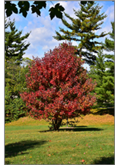
Redpointe Red Maple in fall

This tree should only be grown in full sunlight. It is quite adaptable, preferring to grow in average to wet conditions, and will even tolerate some standing water. It is not particular as to soil type, but has a definite preference for acidic soils, and is subject to chlorosis (yellowing) of the foliage in alkaline soils. It is somewhat tolerant of urban pollution. This is a selection of a native North American species.