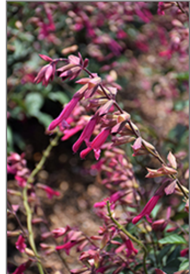
Wendy's Wish Sage flowers

Wendy's Wish Sage is recommended for the following landscape applications;