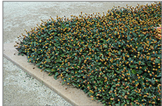
Peek A Boo Para Cress in bloom

Peek A Boo Para Cress is recommended for the following landscape applications;