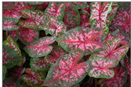
Carolyn Whorton Caladium foliage