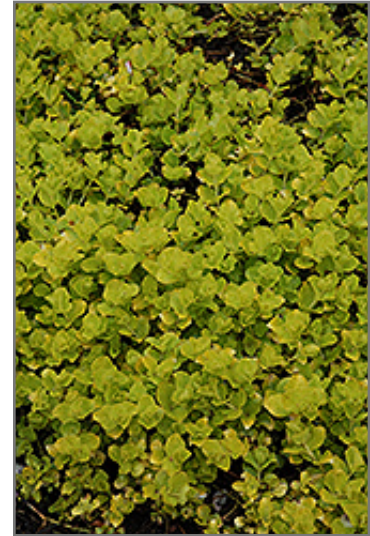
Golden Creeping Jenny foliage

Golden Creeping Jenny is recommended for the following landscape applications;