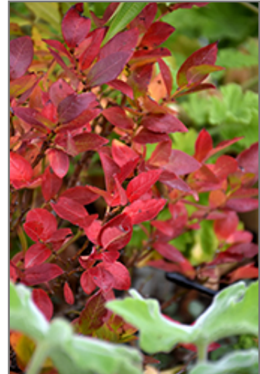
Jelly Bean Blueberry in fall

Jelly Bean Blueberry features dainty clusters of white bell-shaped flowers with shell pink overtones hanging below the branches in mid spring. It has red-variegated green foliage. The glossy oval leaves turn an outstanding red in the fall. It features an abundance of magnificent blue berries in mid summer.