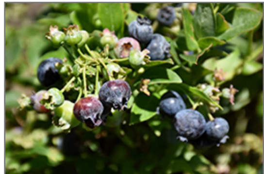
Jelly Bean Blueberry fruit