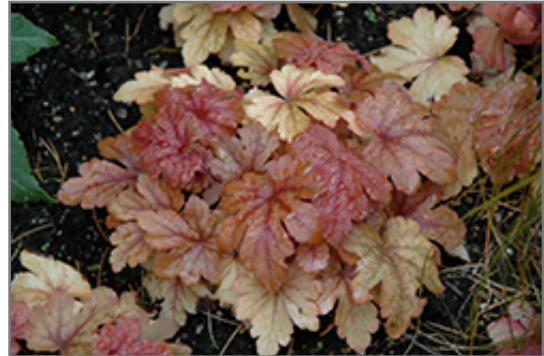
Buttered Rum Foamy Bells

Buttered Rum Foamy Bells is recommended for the following landscape applications;