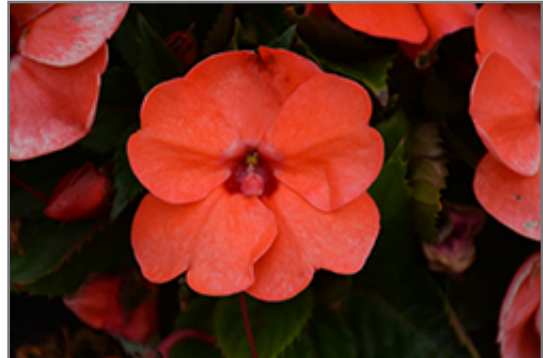
SunPatens Compact Hot Coral New Guinea Impatiens flowers

SunPatens Compact Hot Coral New Guinea Impatiens is a dense herbaceous annual with a mounded form. Its medium texture blends into the garden, but can always be balanced by a couple of finer or coarser plants for an effective composition.