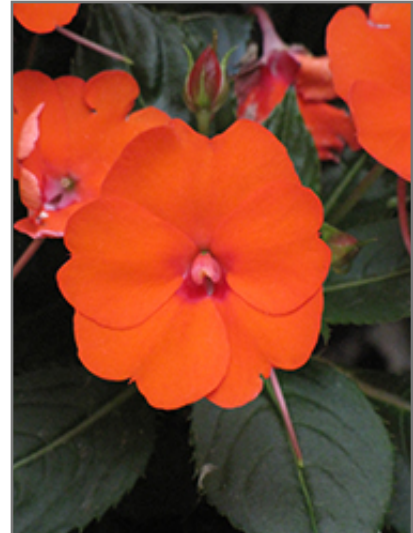
SunPatens Compact Electric Orange New Guinea Impatiens flowers

SunPatens Compact Electric Orange New Guinea Impatiens is a dense herbaceous annual with a mounded form. Its medium texture blends into the garden, but can always be balanced by a couple of finer or coarser plants for an effective composition.