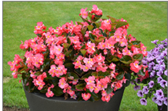
Surefire Rose Begonia in bloom