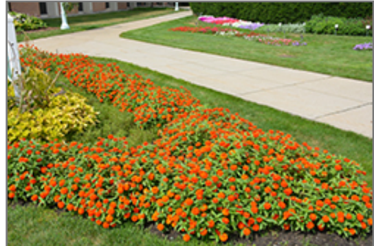
Profusion Double Fire Zinnia in bloom

Profusion Double Fire Zinnia will grow to be about 14 inches tall at maturity, with a spread of 18 inches. When grown in masses or used as a bedding plant, individual plants should be spaced approximately 14 inches apart. Its foliage tends to remain dense right to the ground, not requiring facer plants in front. This fast-growing annual will normally live for one full growing season, needing replacement the following year.