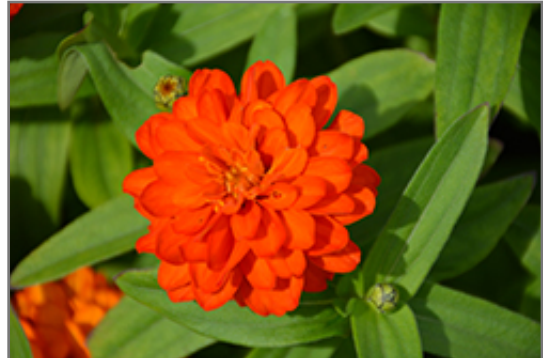
Profusion Double Fire Zinnia flowers

Profusion Double Fire Zinnia is recommended for the following landscape applications;