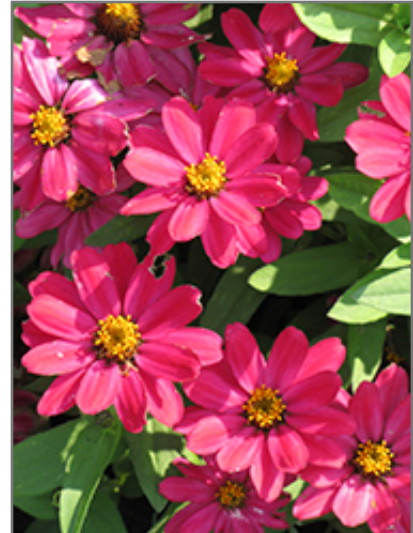
Profusion Cherry Zinnia flowers