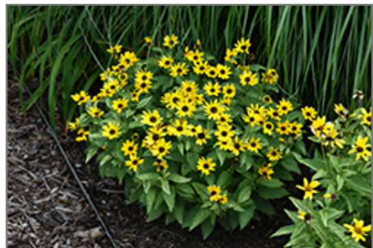
Sunburst False Sunflower in bloom