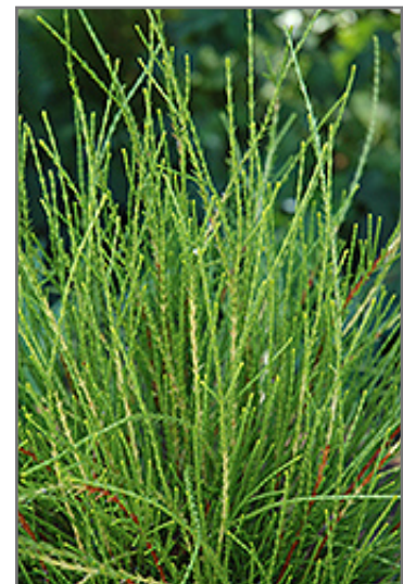
Franky Boy Arborvitae foliage