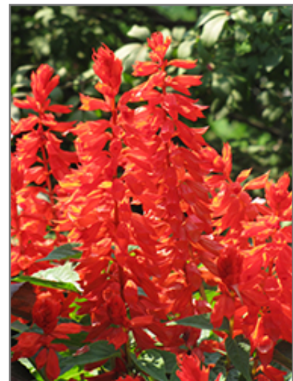
Lighthouse Red Sage flowers