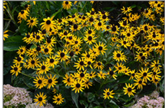
Little Goldstar Coneflower in bloom

This is a relatively low maintenance plant, and should be cut back in late fall in preparation for winter. It is a good choice for attracting butterflies to your yard, but is not particularly attractive to deer who tend to leave it alone in favor of tastier treats. It has no significant negative characteristics.