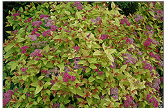
Magic Carpet Spirea flowers