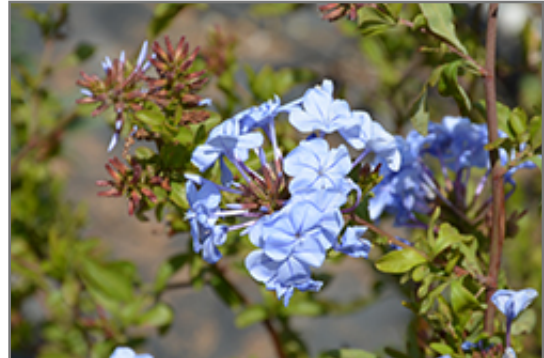
Imperial Blue Plumbago flowers

Imperial Blue Plumbago is recommended for the following landscape applications;