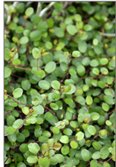
Creeping Wire Vine foliage