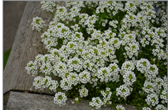
Snow Princess Alyssum flowers

Snow Princess Alyssum is recommended for the following landscape applications;