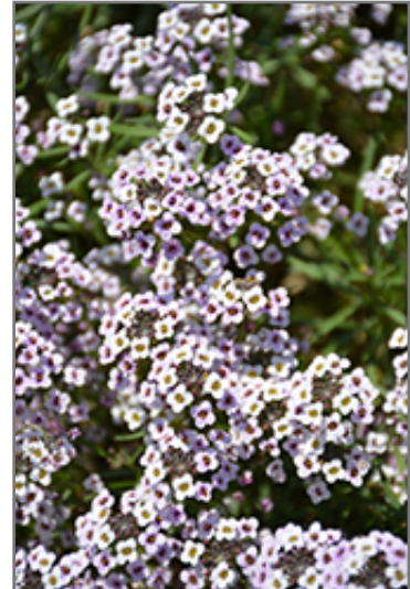
Blushing Princess Sweet Alyssum flowers

This plant will require occasional maintenance and upkeep, and should not require much pruning, except when necessary, such as to remove dieback. It is a good choice for attracting bees and butterflies to your yard, but is not particularly attractive to deer who tend to leave it alone in favor of tastier treats. It has no significant negative characteristics.