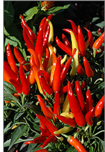
Chilly Chili Ornamental Pepper fruit

Chilly Chili Ornamental Pepper is an herbaceous annual with an upright spreading habit of growth. Its medium texture blends into the garden, but can always be balanced by a couple of finer or coarser plants for an effective composition.