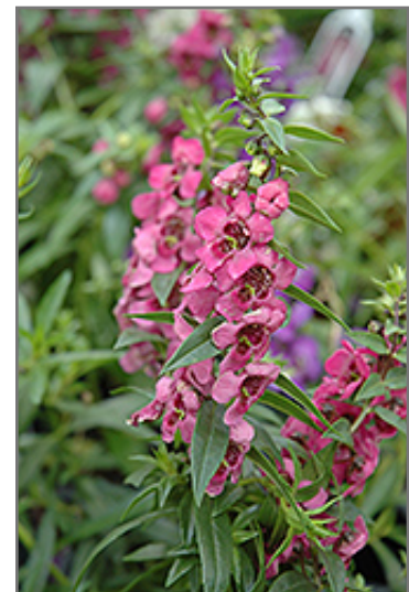
Pink Angelonia flowers