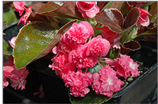
Doublet Rose Begonia flowers

This is a high maintenance plant that will require regular care and upkeep, and usually looks its best without pruning, although it will tolerate pruning. Deer don't particularly care for this plant and will usually leave it alone in favor of tastier treats. Gardeners should be aware of the following characteristic(s) that may warrant special consideration;