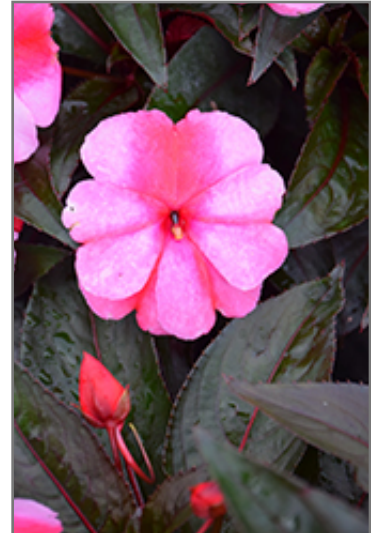
Super Sonic Sweet Cherry New Guinea Impatiens flowers

This plant will require occasional maintenance and upkeep, and should not require much pruning, except when necessary, such as to remove dieback. It has no significant negative characteristics.