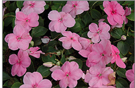
Super Elfin XP Pink Impatiens flowers