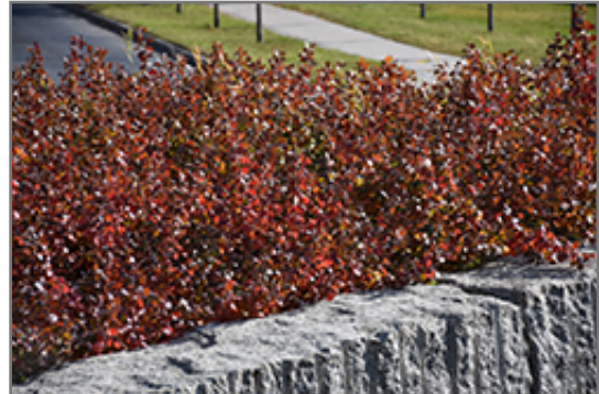
Gro-Low Fragrant Sumac in fall

This shrub performs well in both full sun and full shade. It is very adaptable to both dry and moist locations, and should do just fine under typical garden conditions. It is not particular as to soil type, but has a definite preference for acidic soils, and is subject to chlorosis (yellowing) of the foliage in alkaline soils. It is highly tolerant of urban pollution and will even thrive in inner city environments. Consider applying a thick mulch around the root zone in winter to protect it in exposed locations or colder microclimates. This is a selection of a native North American species.