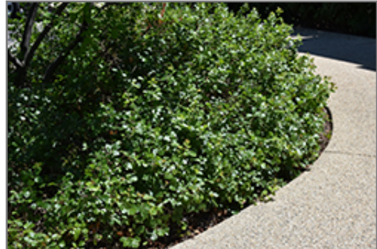
Gro-Low Fragrant Sumac

Gro-Low Fragrant Sumac is recommended for the following landscape applications;