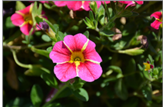
Superbells Cherry Star Calibrachoa flowers

Superbells Cherry Star Calibrachoa is a dense herbaceous annual with a trailing habit of growth, eventually spilling over the edges of hanging baskets and containers. Its medium texture blends into the garden, but can always be balanced by a couple of finer or coarser plants for an effective composition.