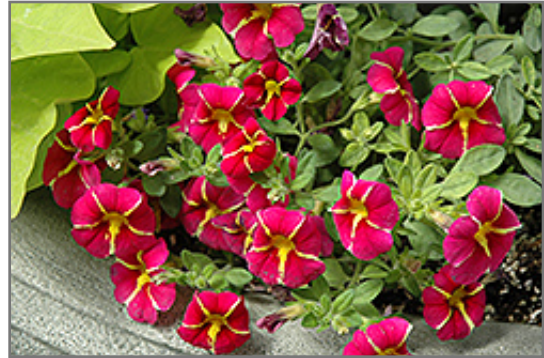
Superbells Cherry Star Calibrachoa flowers